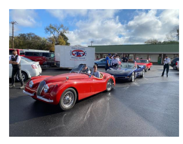
November - First American Filling Station Cruise-in