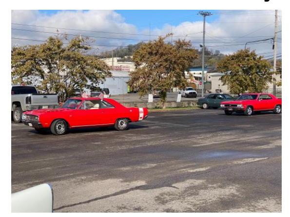
November 11th · Pulaski Veterans Day Parade